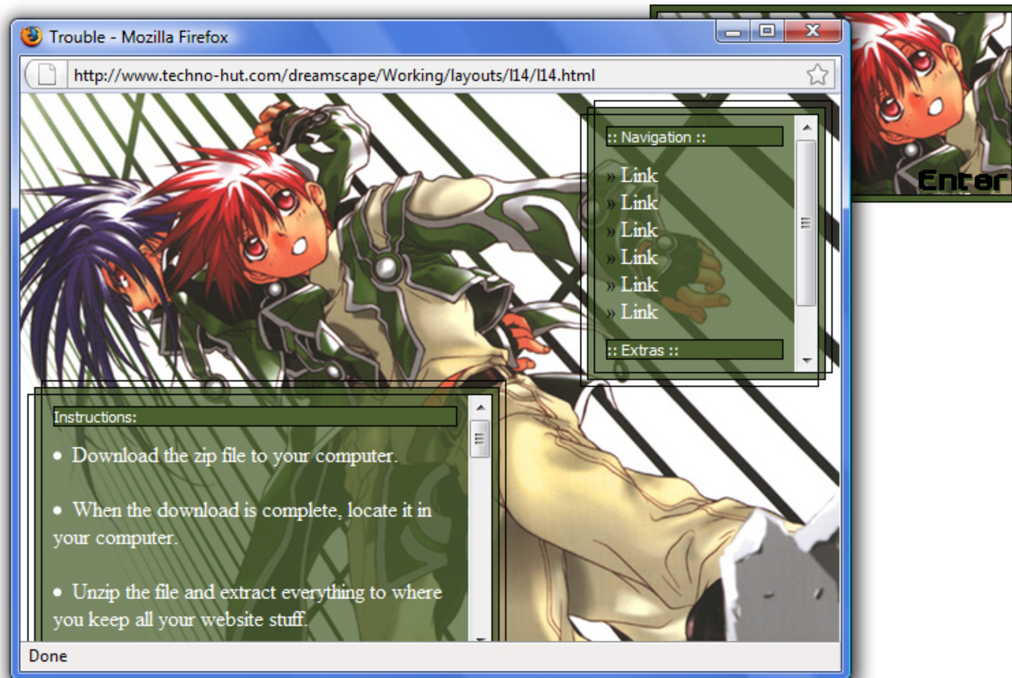
2003 template popup layout