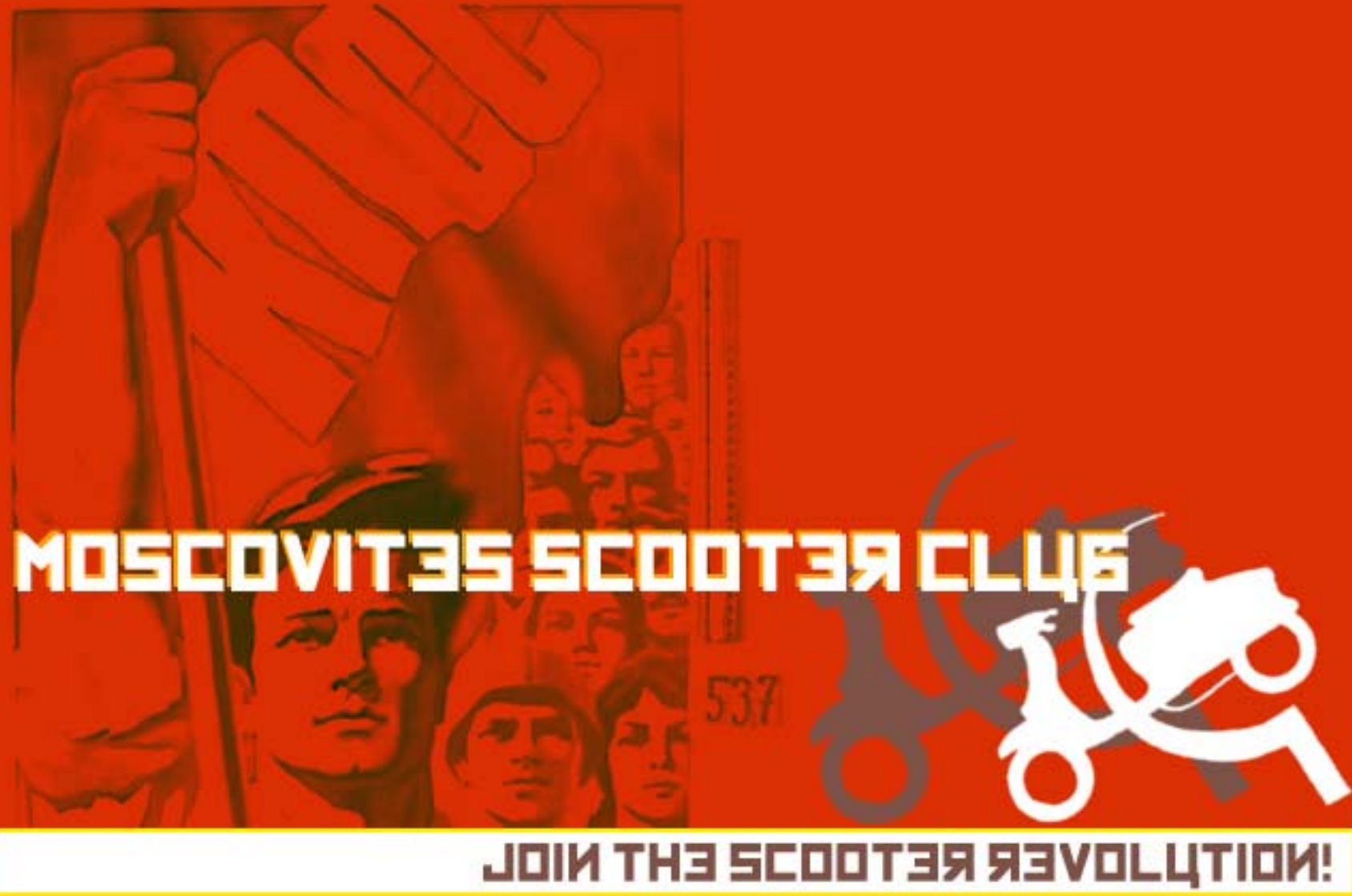
2009 moscovites scooter club website